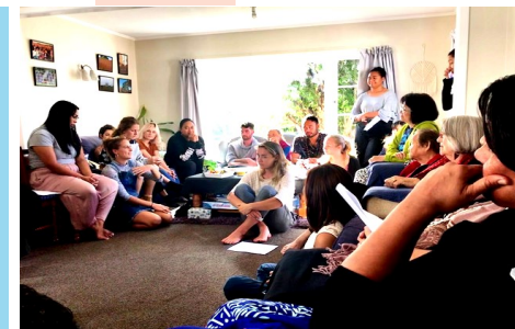
Nga Tupu lounge and guests (Above centre)

We are called to be holy by living our lives with love and by bearing witness in everything we do, wherever we find ourselves. Pope Francis- Gaudete et Exsultate